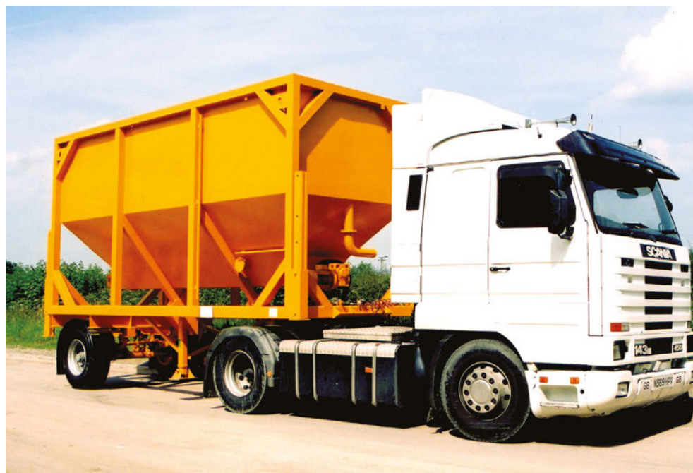
22m 3 Mobile horizontal filler silo for a 160t/h mobile asphalt plant

Parker low profile silos are designed for reclaimed or imported filler as self contained units and mounted on running gear; silos are available in two sizes to feed material into the filler weigh hopper via screw conveyors. The unique and innovative design means that it is extremely easy to transport and relocate, complementing the whole reason for a fully mobile asphalt plant.