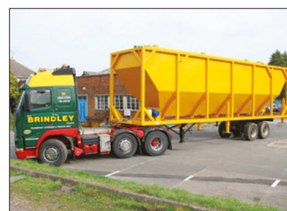
45m 3 Mobile reclaimed filler storage silo