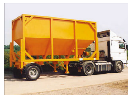
22m 3 Mobile imported filler storage silo