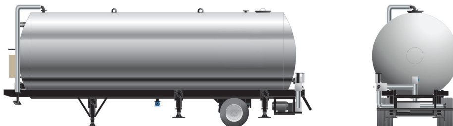
Illustration shows a 50,000 litre 'Fastmover' mobile bitumen storage tank

Capacities, dimensions and performance data are subject to minor variations and are not contracted descriptions, therefore the company reserve the right to alter specification details as described herein.