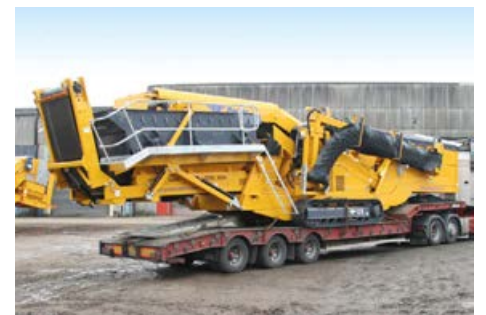
Conveyors folded and ready for transport.

Parker Plant Limited, Viaduct Works, Canon Street, Leicester, LE4 6GH, United Kingdom