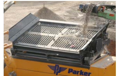
2 deck vibrating live head option.