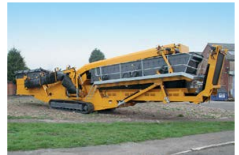
Conveyors folded and ready for transport.

Parker Plant Limited, Viaduct Works, Canon Street, Leicester, LE4 6GH, United Kingdom