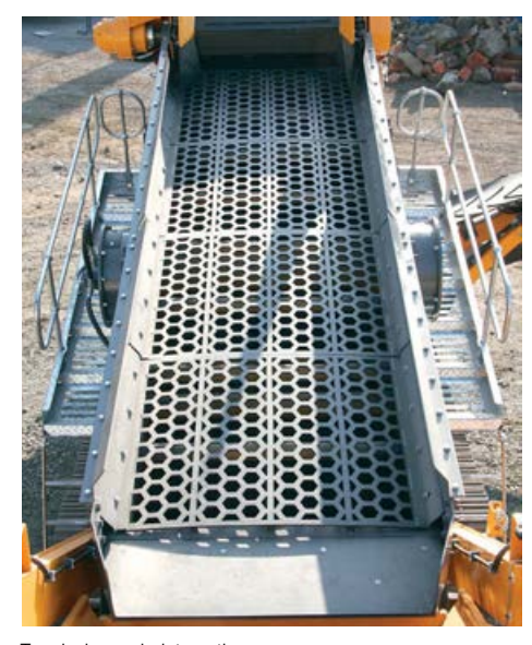
Top deck punchplate option.